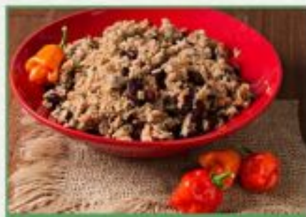
RICE AND PEAS