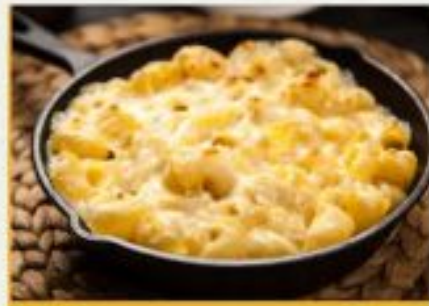
MAC & CHEESE