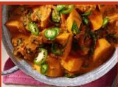
SWEET POTATO & SPINACH CURRY