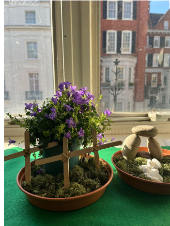
Year 1's Easter garden