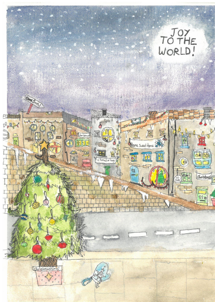
Ada Yr 4